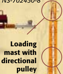
Loading mast with directional pulley

25' x 3/8" (7,62 m X 9,5 mm) low-stretch double-braided polyester cable Breaking point: 4 000 lb (1 814 kg)