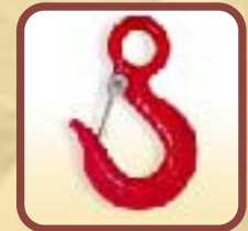
Safety hook NS-702313