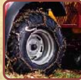
ATV continuous traction chains. For 24 x 9.0-11 to 27 x 12.0-12 tires NS-702610 / 702615