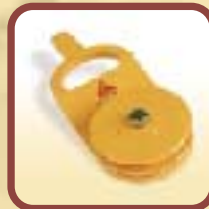
Corner block NS-702306