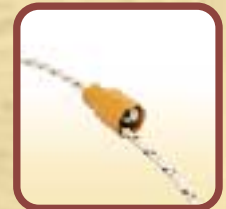
Automatic release NS-702304