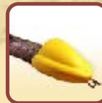
Skidding cone NS-702302