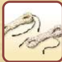
Kevlar or polyester cable NS-7010409 / 7010412