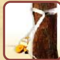
Polyester choker 6' (1,83 m) X 1 ply NS-7010415