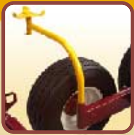
Loading Pivot NS-702450-8