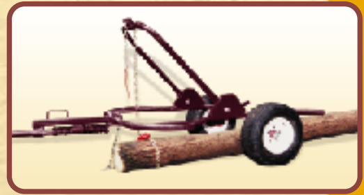
Logging arch NS-702300