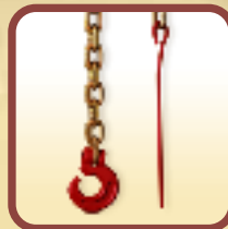
Chain-choker 5 1/2' or 8' (1,68 m or 2,44 m) NS-702312 / 702301