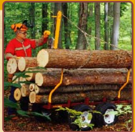
Loading mast with V-Chain