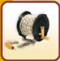
Storage reel NS-702309