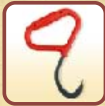
Lifting hook NS-702205