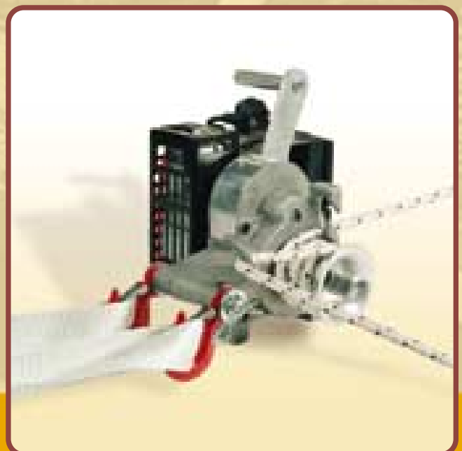
Capstan winch NS-702311