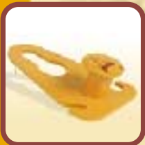
Pulling plate NS-702307