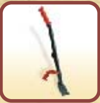
Felling lever 31" (79 cm) NS-702203