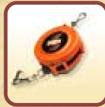
Measuring tape 50' (15 m) NS-702204