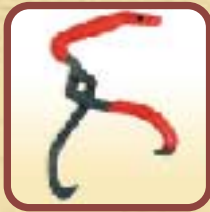
Lifting tong 8" (20 cm) NS-702206