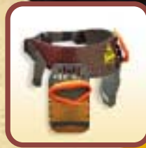
Tool belt NS-702201 (acc. sold separately)