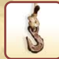
Flat hook 5/16" (0,3 cm) NS-702308